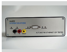
Picture 1: IOP tester from RUETZ SYSTEM SOLUTIONS tests ECUs for interoperability