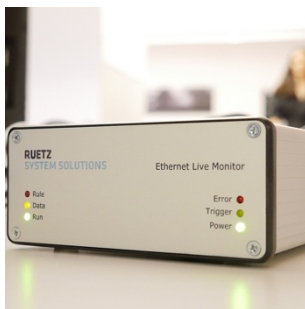
Image 1: The Ethernet Live Monitor identifies the according errors in the live stream and triggers the data logger.